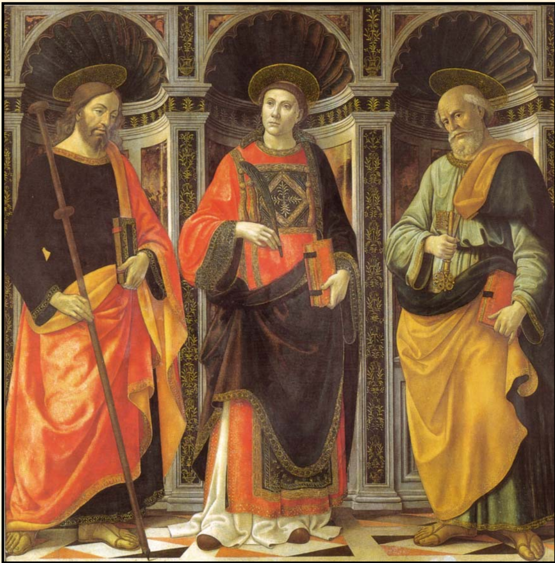
Artist: Domenico Ghirlandaio, 1449-1494; Florence, Italy

The feast of Saint Stephen is celebrated on the 26 th of December, in Western churches, 27 th of December, in the East. The feast, during medieval times, was a time when the Lord, or land owner, would invite his subjects/workers, to his home to for the feast. The subjects were awarded gifts to honor their loyalty to the Lord or land owner of the estate. By design, this would echo rewarding Saint Stephen's devotion to Jesus at the cost of his own life.