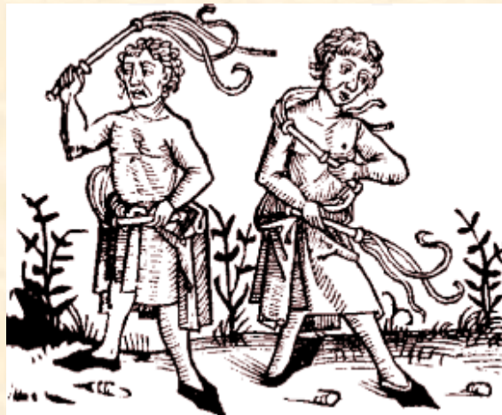
Medieval Tymes staff hard at work

Cover art is Fra Lippo Lippi’s “Portrait of a Man and Woman at a Casement ” (1440) http://commons.wikimedia.org/wiki/File:Lippo_lippi_woman.jpg