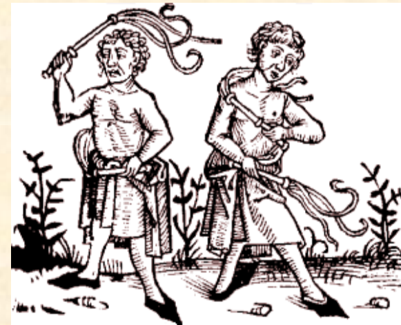
Medieval Tymes staff hard at work