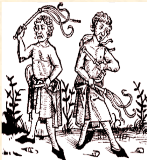
Medieval Tymes staff hard at work

Cover is Summer In the Citadel ... (no, not really). It's "The Garden of delights" (Hortus Deliciarum) by an unknown German miniaturist, c. 1180 Illumination on parchment. From the Bibliothèque Nationale, Paris by way of the Web gallery of art, http://www.wga.hu/art/zgothic/miniatur/1151-200/3german/05g_1150.jpg