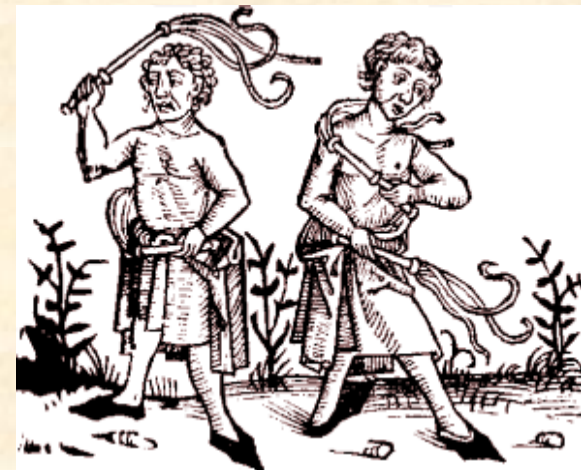
Medieval Tymes staff hard at work

This issue of the Medieval Tymes brought to you by channel 54 on XM Radio.